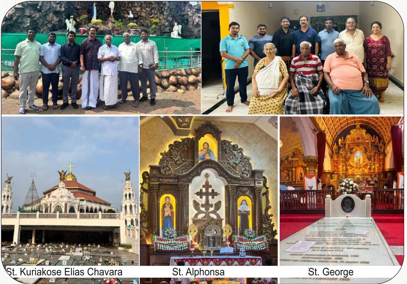
St. Kuriakose Elias Chavara

This pilgrimage clearly demonstrated that our community remains united, walking forward together in faith, harmony, and mutual support. It was truly a blessed experience that will remain in our hearts for a long time.