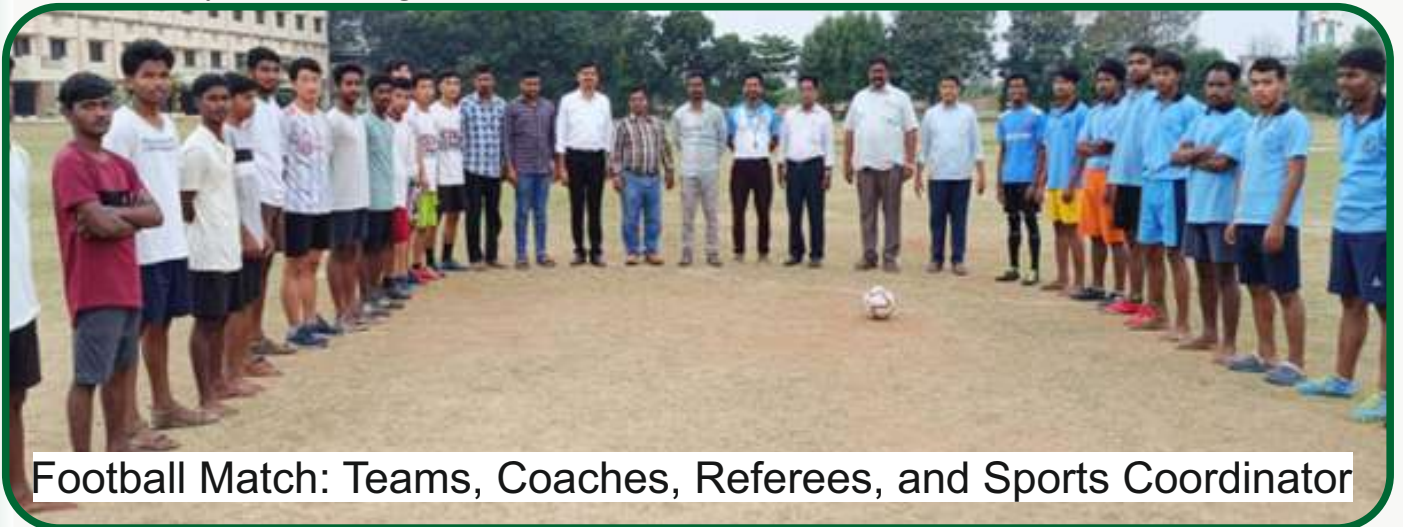
Football Match: Teams, Coaches, Referees, and Sports Coordinator

The event provided a platform for students to showcase their skills, build relationships, and create lasting memories, highlighting that 'Togetherness is Happiness' and promoting a sense of community and bonding.